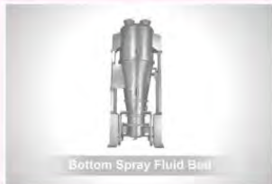
Bottom Spray Fluid Bed