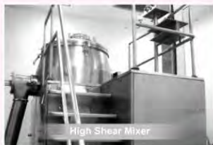
High Shear Mixer