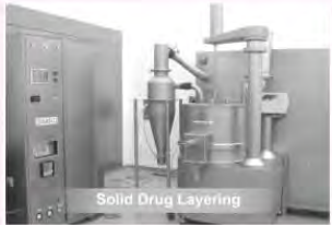
Solid Drug Layering