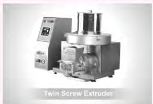
Twin Screw Extruder